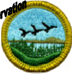
FISH & WILDLIFE MANAGEMENT