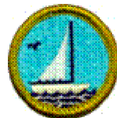
SMALL BOAT SAILING

Preparation: Must have Merit Badge Pamphlet.