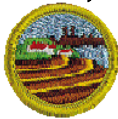
SOIL & WATER CONSERVATION